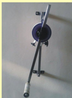
Physio Shoulder Wheel

Members of Bharat Vikas Parishad State South have come forward to equip our physiotherapy lab. With the new equipment the recovery of patients will get accelerated.