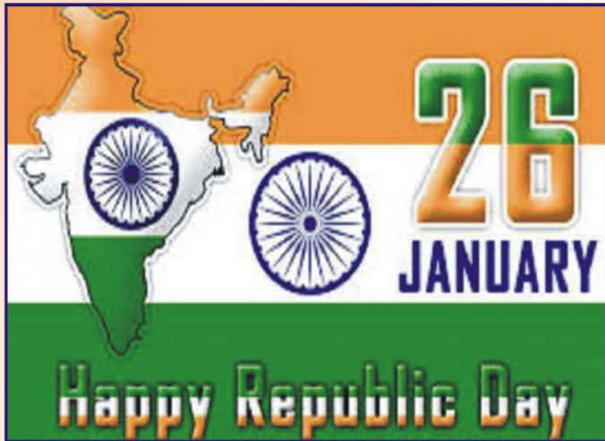
Happy Republic Day