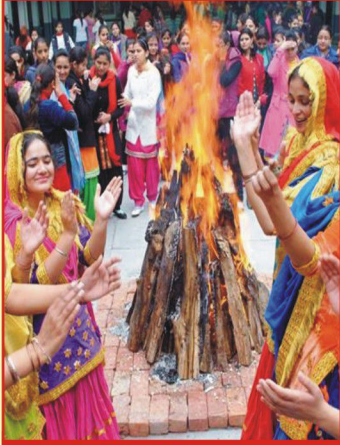
लोहड़ी की हार्दिक शुभकामनाएँ