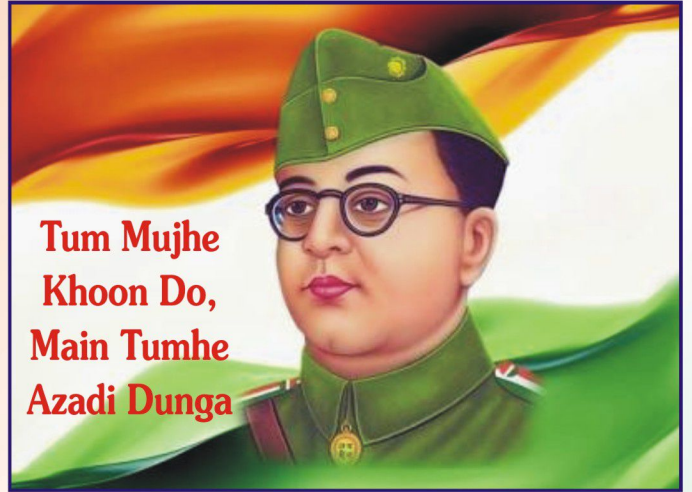
Neta Ji Subhah Jayanti - 23rd January