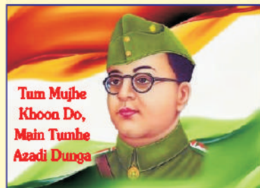
Neta Ji Subhash Jayanti - 23rd January