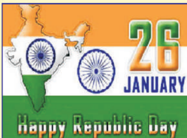
Happy Republic Day