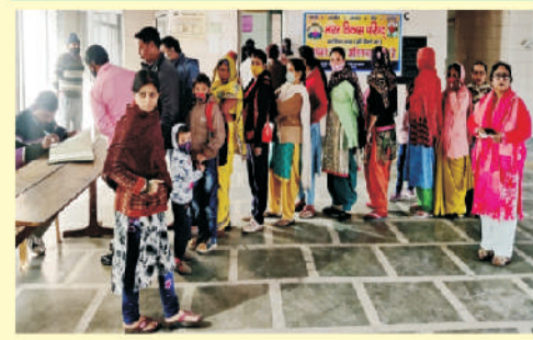
BVP IPEX BRANCH