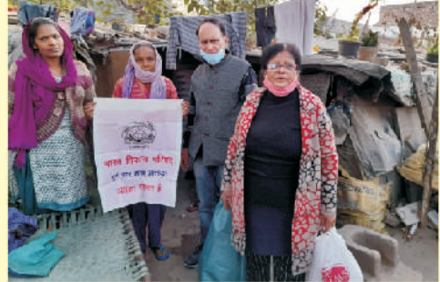
SURYA NAGAR BRANCH