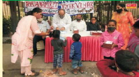
VIVEK VIHAR BRANCH