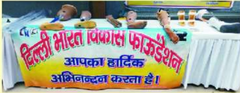
Exhibition at Vivekanand School